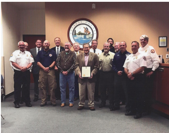
County Proclaims May as Wildfire Preparedness Month