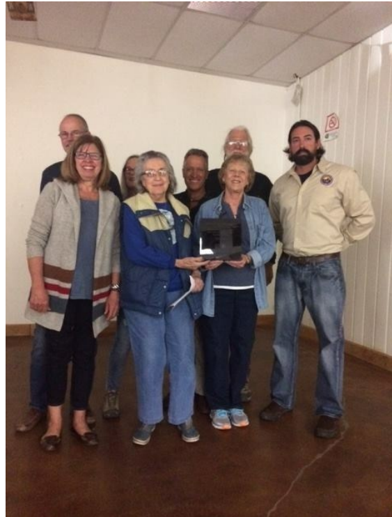
Juniper Heights/Old Senator