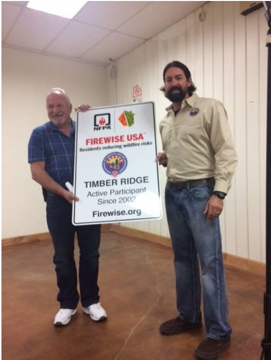
15-Years Firewise—Timber Ridge